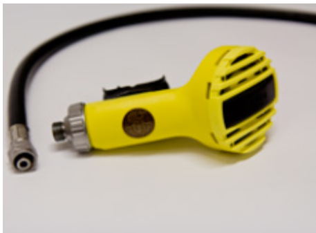
Jetstream Mk3 & Classic Octopus, art. nr 0100-006