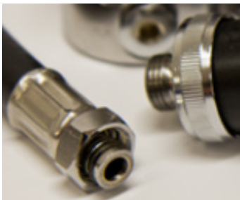
Hose connection, Jetstream Mk3