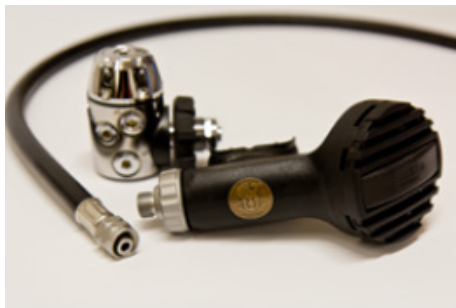
Jetstream Mk3, art. nr 0100-005