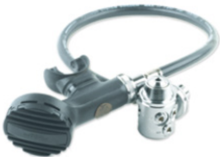
Jetstream Classic, art. nr 3960